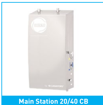
Main Station 20/40 CB