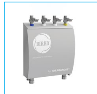
Media Satellite VMS II