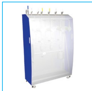
VCC II 70/140 Unit