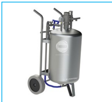
Mobile Foam Unit MFU 75