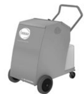
Low Water Pressure Mobile Unit