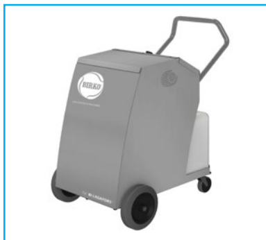
Low Water Pressure Mobile Unit