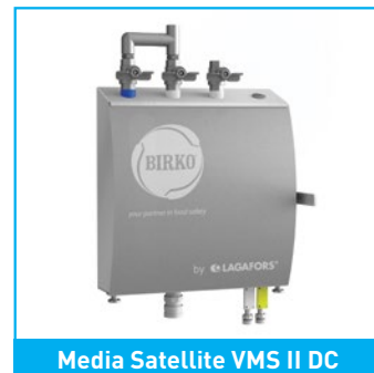
Media Satellite VMS II DC