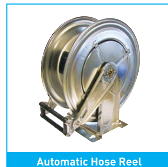
Automatic Hose Reel