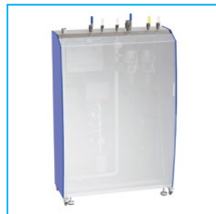
CCU II Combo Unit