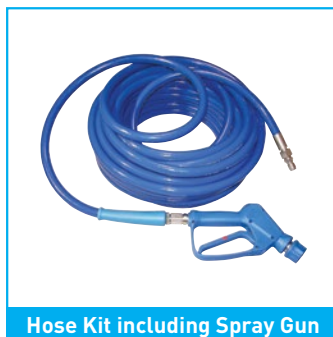
Hose Kit including Spray Gun