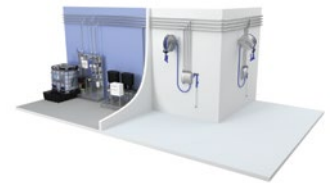
Centralized Cleaning System