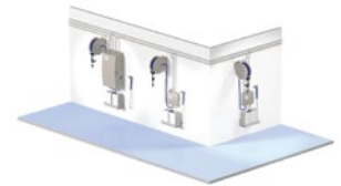
Decentralized Cleaning System